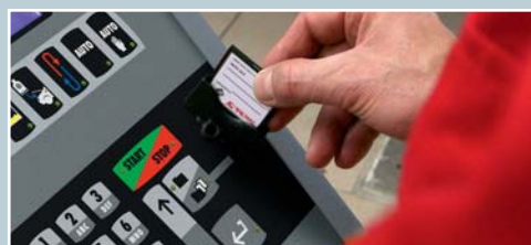
Updatable vehicle database for trucks and passenger cars with Compact Flash Card