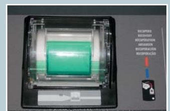
Integrated thermal printer with multiple prints