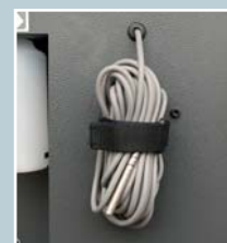
Integrated temperature-measuring sensor