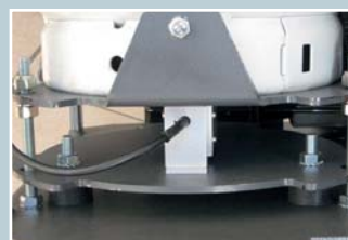
Shock absorbing scale construction – convenient for the mobile use