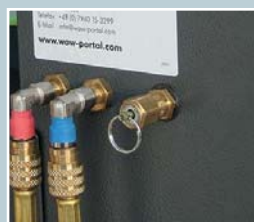
Blow valve and service-hose connection (outside)